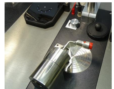
Also suitable for the examination of components up to a size of 70x50mm