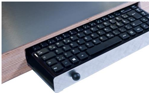
Front drawer with keyboard