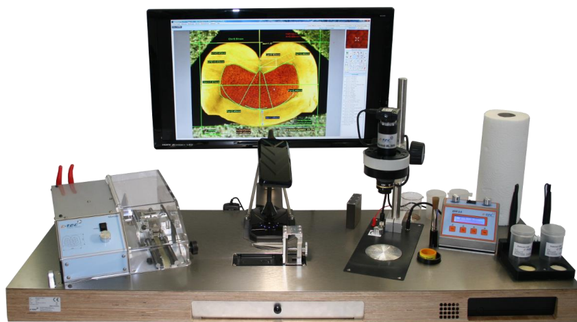
The Microlab ML 3600-pc with integrated mini pc

Tabletop laboratory for cross-section analysis