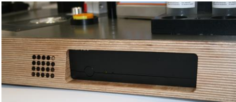
Integrated mini PC